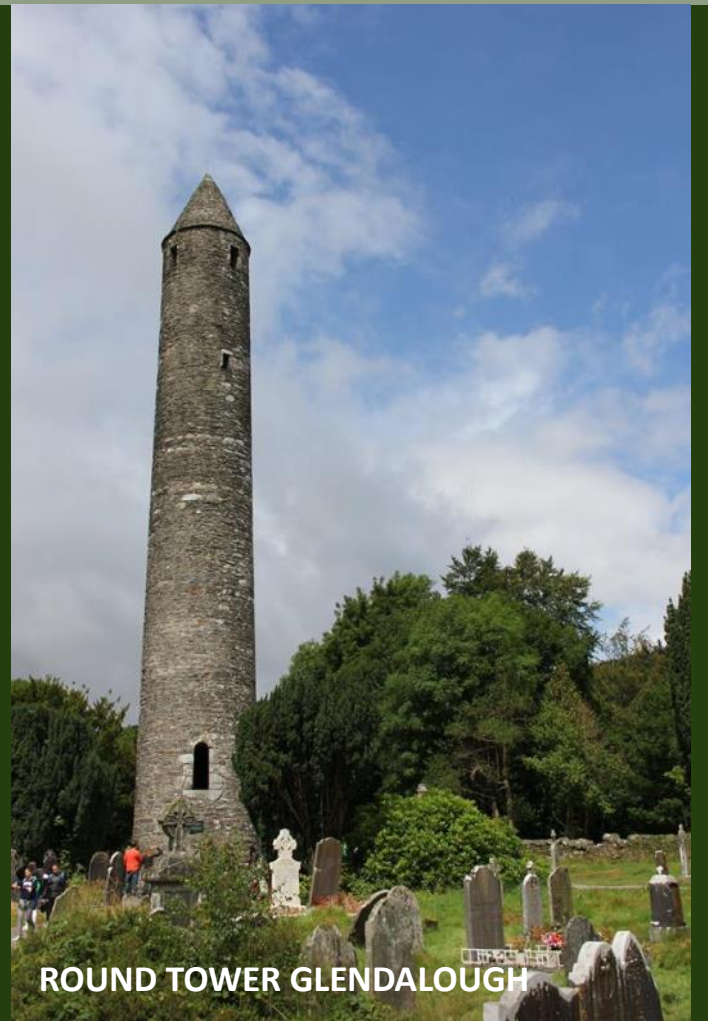
ROUND TOWER GLENDALOUGH

NOTE: This package does not include flights, although these can be arranged for you, if required.