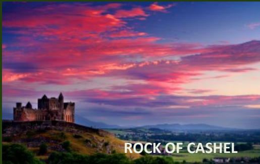
ROCK OF CASHEL