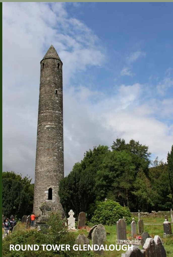
ROUND TOWER GLENDALOUGH

NOTE: This package does not include flights, although these can be arranged for you, if required.