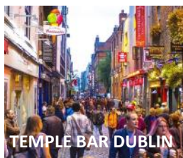
TEMPLE BAR DUBLIN